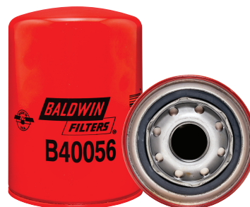
B40056 vs DOOSAN 23279078

UPC: 7 91440 10784 7 Case Quantity: 12 Case Weight: 16.1 lbs. (7,3 kgs.) Filter Weight: 1.3 lbs. ea. (0,608 kgs. ea.) Volume: 0.050 ft³ ea. (0,001 m³ ea.)