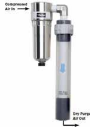
Fig. 3. Cabinet Dryer Assembly

The coalescing filter is housed in an assembly to provide ease of operation and maintenance.