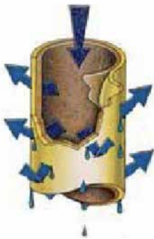
Fig. 1. Coalescing Filter – Used to remove oil and water droplets, particulate matter from compressed air. The liquids drip to the bottom of the filter housing and are automatically emptied by a drain assembly

House compressed air is filtered and dried in a two step process. First, a coalescing filter removes the liquids and particulate matter with an efficiency of 99.99% at 0.01 \mu\text{m} . The liquids drain to the bottom of the housing and are emptied via an automatic drain.