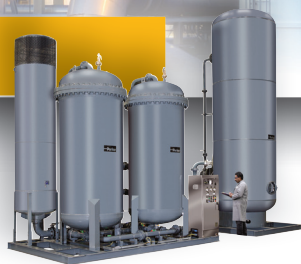
Custom High Flow PSA Nitrogen Generators