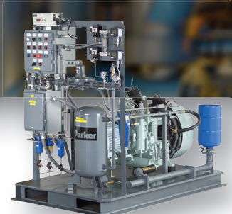
High Pressure Nitrogen Generator Systems