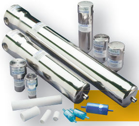
Specialty Gas Sampling Filters