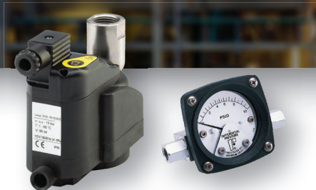
Drains, Gauges, & Other Accessories