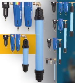
Compressed Air Dryers