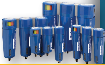
Compressed Air/Gas Filters