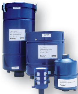
Compressed Air/Gas Vacuum Pump Filters