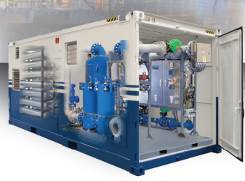
Custom High Pressure Containerized Systems