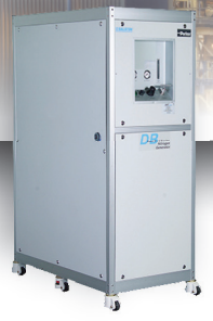
Dual Bed Nitrogen Generators